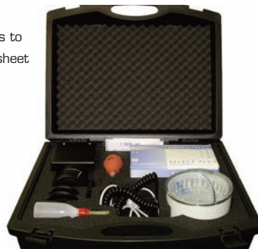
Holma® Dirt and strain viewer and cleaning set to check your laser lenses for dirt and defects