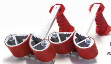
Non-Slip Panel Grips to safely lift and carry sheet materials