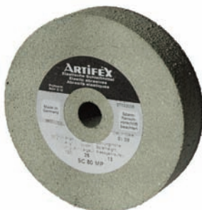
Rubberised Abrasive Wheel to remove galling from punches